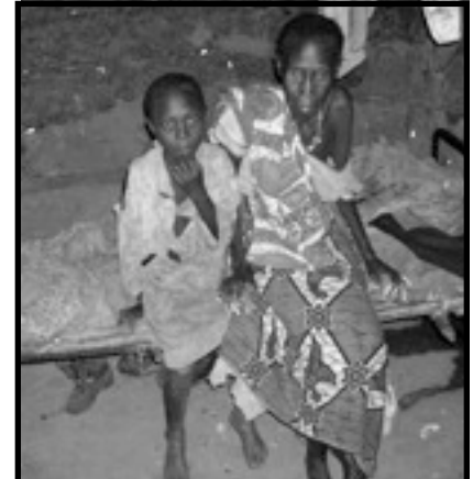
A mother and child sit on a bed in Nyamuswa Tanzania. Their poverty is palpable.

I might even say that I recognize I am part of a society that historically exploited people, resources and regions to achieve its ends; that the effects of that history branch out into the present; that in the privileged life I lead I may inadvertently contribute to the social and historical processes that continue separating us from each other; that I want to minimize the impact of my participation in systems that crown winners while casting off losers; and that as part of my effort to live intentionally within the broken world I have inherited, my involvement with FIOH-USA helps me plug into the struggle to overcome centuries of injustice by building communities rooted in respect for creation and human dignity.