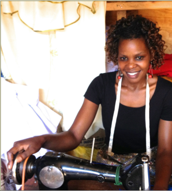
A student of the tailoring school, funded through FIOH-USA, in Kisumu, Kenya is grateful to have an opportunity to learn.