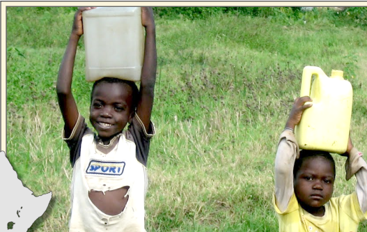
Children start helping to collect water while very young.